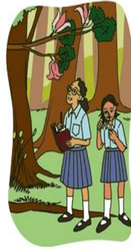
Figure 2.4: Observing with the naked eye and a magnifying lens

Write your responses based on observations and discussions in tables 2.3 to 2.7 for each of the places you visit. There are many rows and columns in a biodiversity register (tables 2.3. to 2.7). Try to fill up as many as possible. You can also add more rows related to other kinds of information in discussion with your teacher and peers. You can also make new tables related to living things that are around you. For example, if you live in a big city, look for flowering and fruit trees in the colony garden, and so on (Figure 2.4 and 2.5).