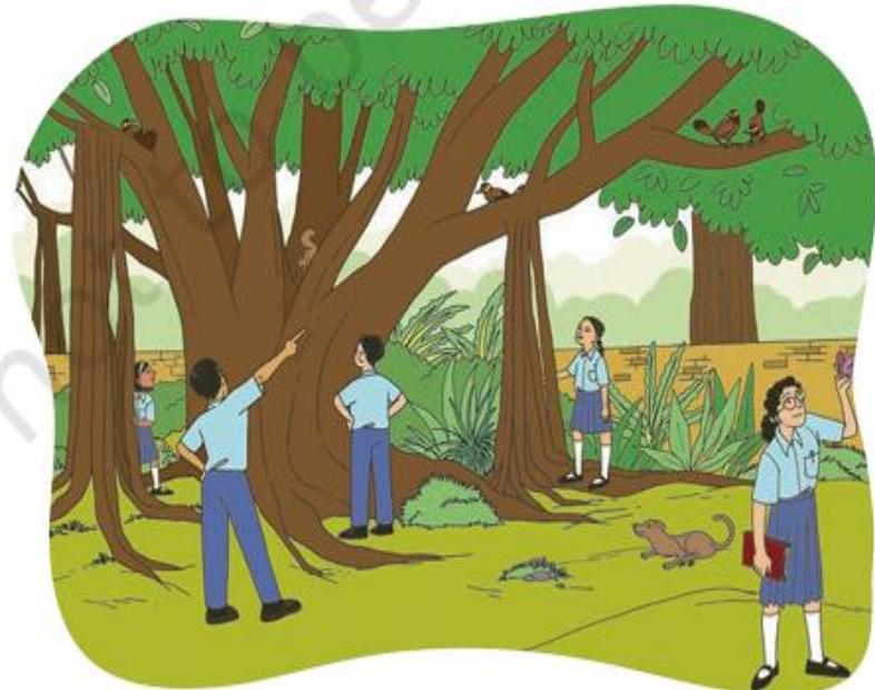
Figure 2.1: Look around at the diversity of living things in your surroundings