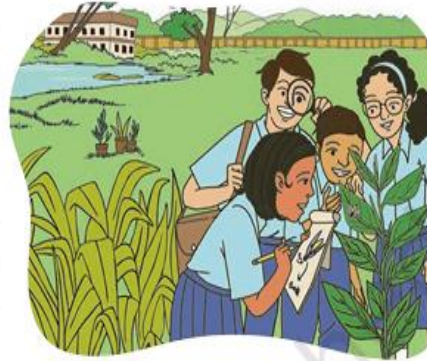
Figure 2.2: Recording observations of living things around us

Look around and observe the living things you can spot. You will find that each one of the plants supports a tiny cosmos full of insects, spiders, squirrels, birds, and other creatures that feed on it and seek shelter amongst its leaves and branches (Figure 2.2). You will record some of your observations and related information in your biodiversity register.