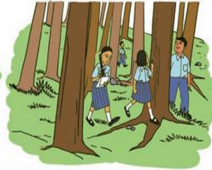
Figure 2.3 (b): Forest