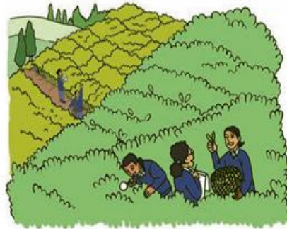
Figure 2.3 (c): Farm