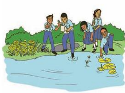
Figure 2.3 (a): Pond