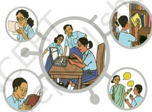
Figure 2.6: Use multiple sources of information to find the information you need

If there is any missing information or any additional information you may need to complete the tables from 2.3 to 2.7. You can ask an expert or a knowledgeable person in the community. You can use an AI tool or school library for getting information (Figure 2.6).