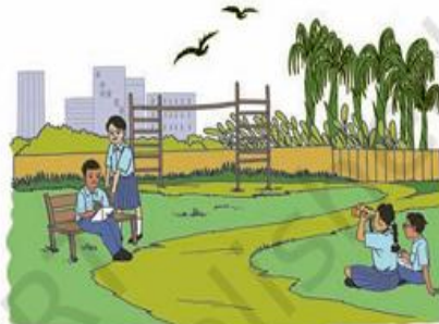
Figure 2.3 (d): Park